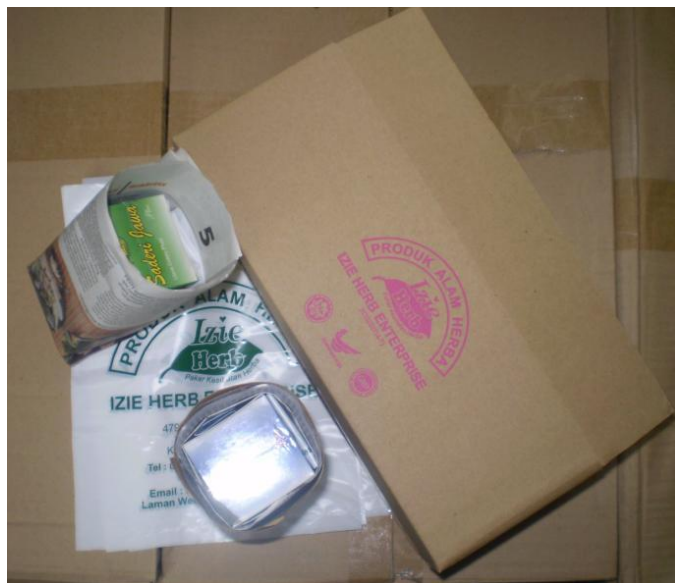
Carton Box, Paper and Plastic Bags