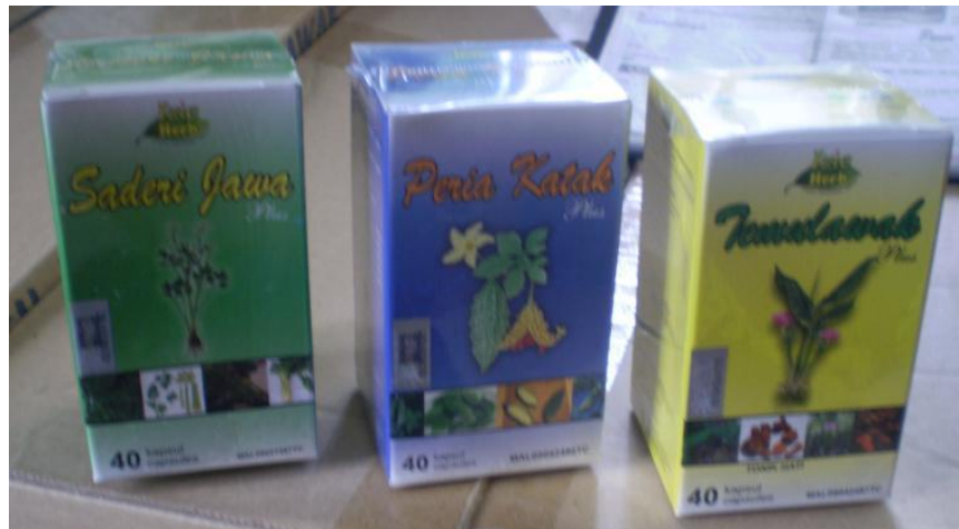
Izie Herb Enterprise Products