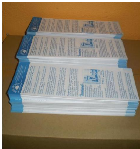
Leaflets to be distributed