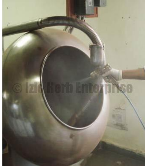
Rinse and Washing Tab