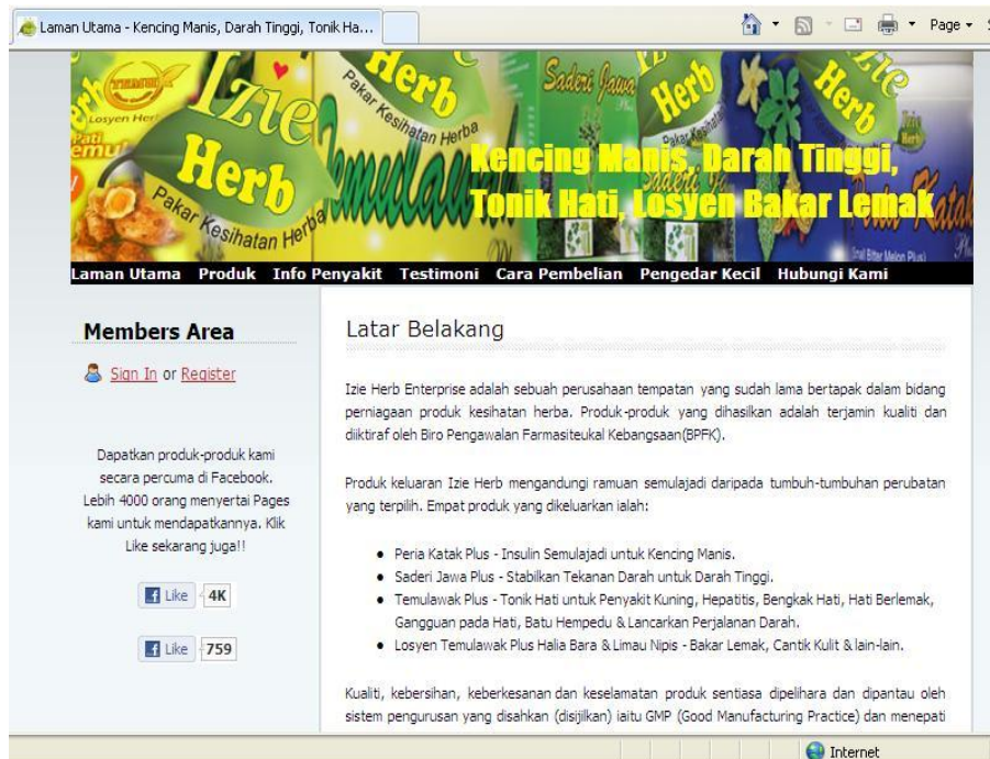
Izie Herb Enterprise' Website