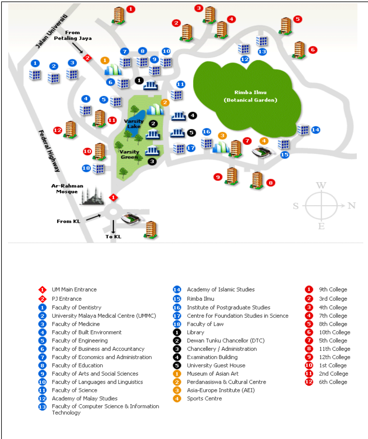
Figure 3.1.11: UM Map