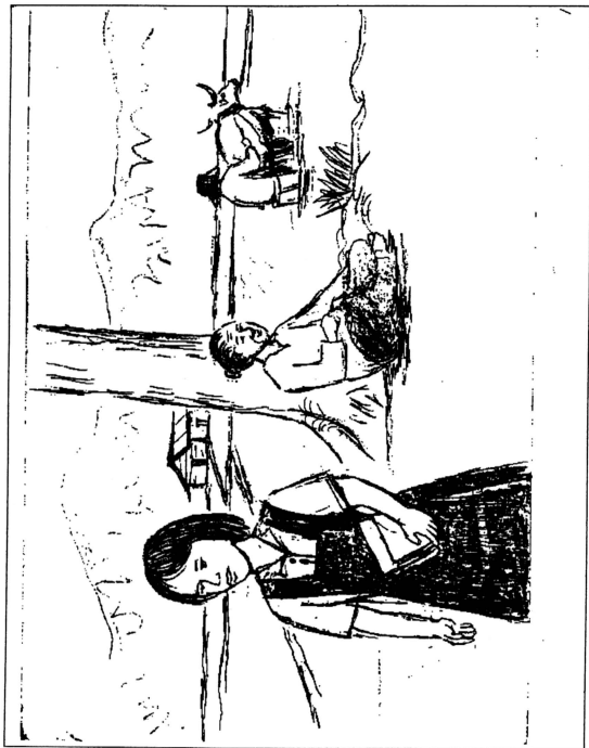
PICTORIAL STIMULUS 2