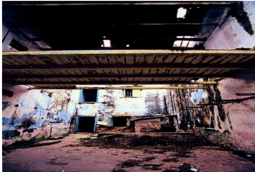
Figure 1.3: Building in poor condition (Author, 2009)

information but there are still gaps. She agreed that monitoring and enforcing are weak. All of these require manpower and resources among the authorities and these have yet to be effectively in place. Erne (2009) stated that many owners in the WH cities do not have the financial resources to undertake repairs and restoration. Supported by Tan (2009), one of the challenges is the lack of available incentives. Some are in place but they appear insufficient to stimulate and motivate owners to do more. Figures 1.1, 1.2, 1.3 and 1.4 show the condition of the buildings on the WH site in Melaka.