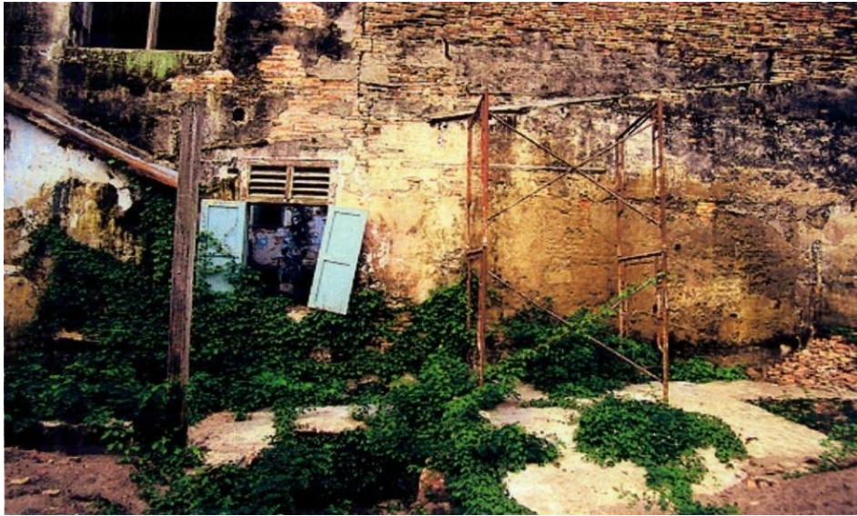
Figure1.4: Vacant lot at WH site (Author, 2009)

These are among the most threatening factors to WH cities not only faced by Melaka and George Town but it is also similar at many other WH sites as the city requires development for economic gain. These are the challenges to the management to have long term conservation and protection of the cultural properties if the WH sites want to sustain their status as WH sites at UNESCO List.