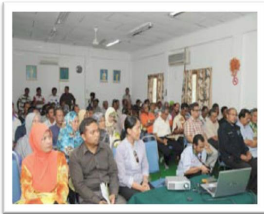
Figure 5.5: PGM for Tioman Island Co-operative held on the 8th Mac 2011 in Peladang Inn, Tioman Island, Pahang