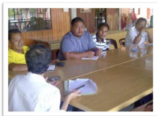
Figure 5.10: CCC and the KPTMB (Tinggi Co-op) meeting on the direction of their co-op, 25th Mei 2011, Tanjung Balang, Tinggi Island, Johor

Note: The meeting went well in their village Community Hall (Balairaya), Kampung Baru Redang, Redang Island, Terengganu