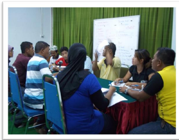
Figure 5.16: Training Workshop, 28th-30th October 2011, Peladang Inn Kampung Tekek, Tioman Island, Pahang.

Note: Participants are working in group to complete tasks given by workshop instructor. Team work is the focus of workshop.