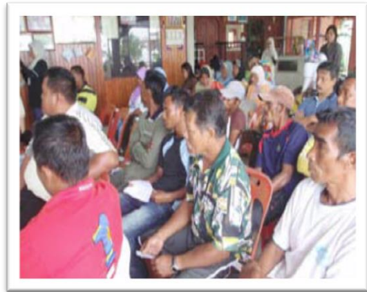
Figure 5.6: PGM for Tinggi Island co-operative held on the 17th March 2011, at Tok Mok's place in Tanjung Balang, Tinggi Island, Johor