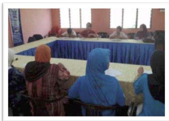
Figure 5.9: CCC and KPPRB (co-op) meeting on the direction of their co-operative held on the 12th May 2011.

Note: The meeting went well in their village Community Hall (Balairaya), Kampung Baru Redang, Redang Island, Terengganu