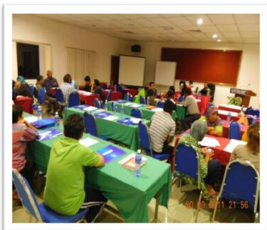
Figure 5.14: Training Workshop, 20th-22nd September 2011, Salang Pusaka, Kampung Baru, Salang, Tioman Island, Pahang

Note: Participants listening tentatively to the speakers