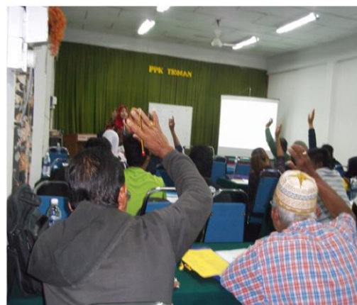
Figure 5.15: Training Workshop, 28th-30th October 2011, Peladang Inn Kampung Tekek, Tioman Island, Pahang.

Note: Participants responding to the lecturer's question