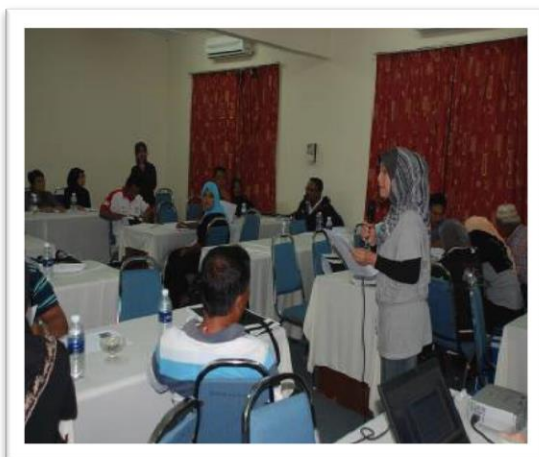
Figure 5.12: Co-operative Management and Administrative Course, 20-22 July 2011, Pesona Island Resort, Tioman Island, Pahang

Note: Participants listening to CCM lecturer giving talks in the workshop