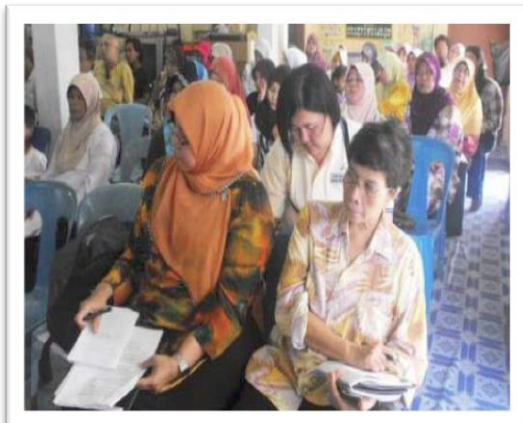
Figure 5.7: PGM for Redang Island's co-operative, held on the 31st March 2011 in the Community Hall (Balairaya) Kampung Baru Redang, Redang Island, Terengganu