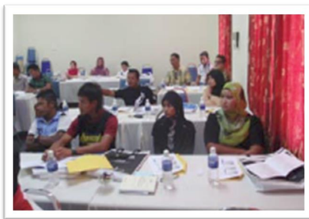
Figure 5.11: Co-operative Management and Administrative Course, 20th-22nd July 2011, Pesona Island Resort, Tioman Island, Pahang

Note: These are some of the villagers who had participated in the workshop.