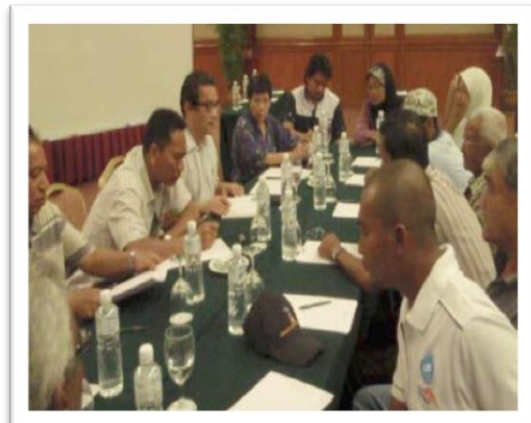
Figure 5.8: CCC and KPTRB (co-op) meeting on the direction of their co-op held on the 25th April 2011, at the Berjaya Tioman Beach, Golf and Spa Resort, Tioman Island, Pahang