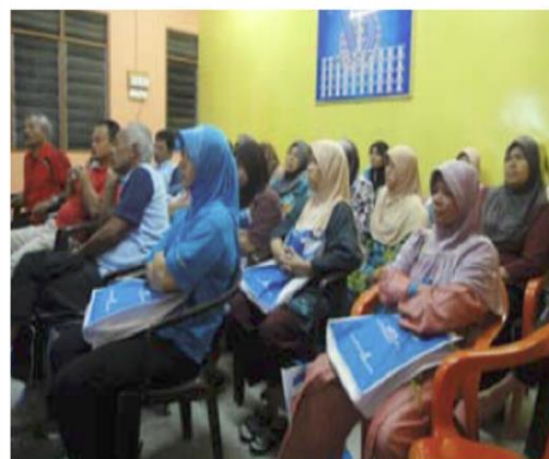
Figure 5.13: Co-operative Management and Administration Course, 27-29 July 2011, Community Hall (Balairaya) Kampung Baru Redang, Redang Island, Terengganu

Note: Participants listening to CCM lecturer giving talks in the workshop