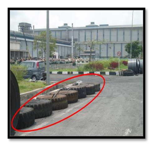
Figure 4.16: Ensuring no coils blocking the view