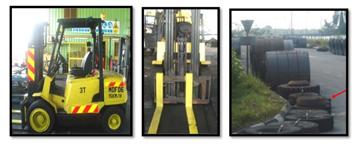
Figure 4.19 and 4.20: Improved forklift visibility