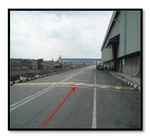
Figure 4.18: Road hump as a speed reducer near admin office