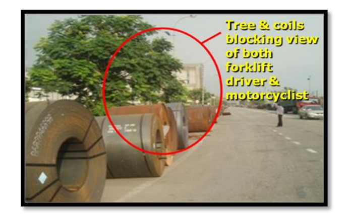
Figure 4.14: Tree and coils are blocking the views