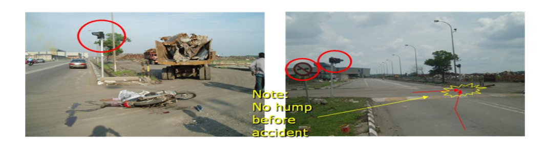
Figure 4.13: No hump before accident