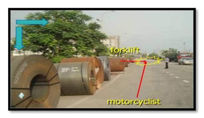
Figure 4.11: Tree and Coils Blocking are the Accident' Factors