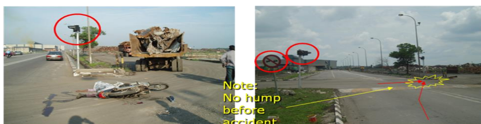
Figure 4.13: No hump before accident