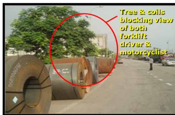
Figure 4.14: Tree and coils are blocking the views