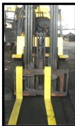
Figure 4.19 and 4.20: Improved forklift visibility