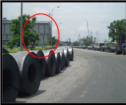
Figure 4.15: Tree blocking view cut down