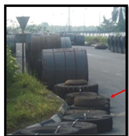
Figure 4.21: Ensuring no coils at corners to minimize hidden view