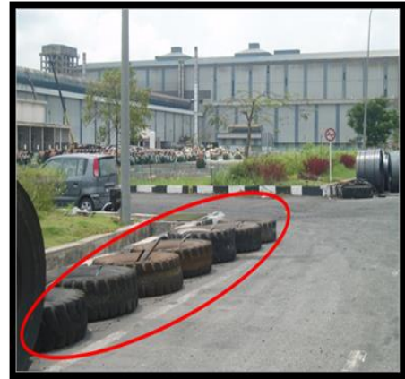
Figure 4.16: Ensuring no coils blocking the view