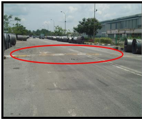
Figure 4.17: Road hump near junction