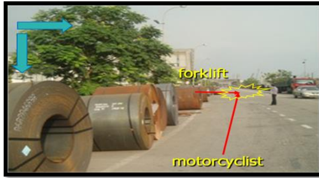
Figure 4.11: Tree and Coils Blocking are the Accident' Factors