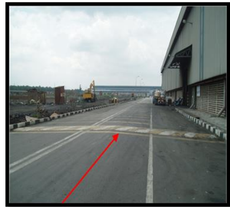
Figure 4.18: Road hump as a speed reducer near admin office