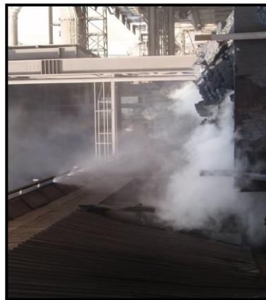
Fig. 4.40: Water Spray