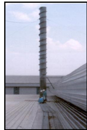
Fig. 4.41: Stack Monitoring