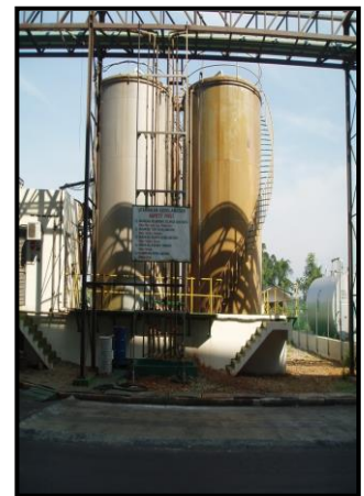
Figure 4.42: Spill Wall

Other than that, the Administrative Control implement includes (1) use of noise enclosures and barriers; spill wall (Figure 4.42) (2) limiting access to noisy locations (3) rescheduling noisy work for limited the time spend (4) implementing of control exposure. Last but not least, (3) the implementation of PPE includes; (1) Wear an ear protection includes plugs and an ear muff (2) suitable and comfortable for the job, type, level of noise, and compatible with other PPE and complies at the DOSH approved complies at the DOSH approved list.