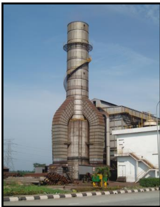
Fig. 4.39: Dust @ bag Collection System

According to EPA (2008) the prevention in minimizing air pollution includes providing adequate ventilation, controlling the sources of pollution, practicing good housekeeping, and using product safely and appliance properly. In controlling the dust at Company, the mitigation measures was taken by using dust @ bag collection system (Figure 4.39) and the water spray (Figure 4.40), while the Stack emission monitoring and control was done at chimney according to the MCERTS-CAAQMS scheme (Figure 4.41). Other than that, some actions can be taken including increasing research and public education, promoting preventive measures, developing air quality guidelines and co-operate with government and agencies.