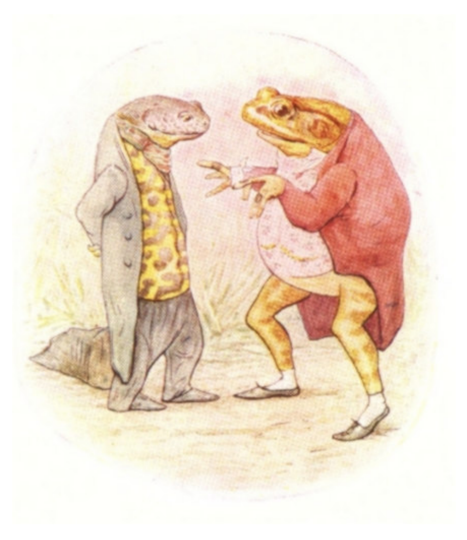
And Mr. Alderman Ptolemy Tortoise brought a salad with him in a string bag.