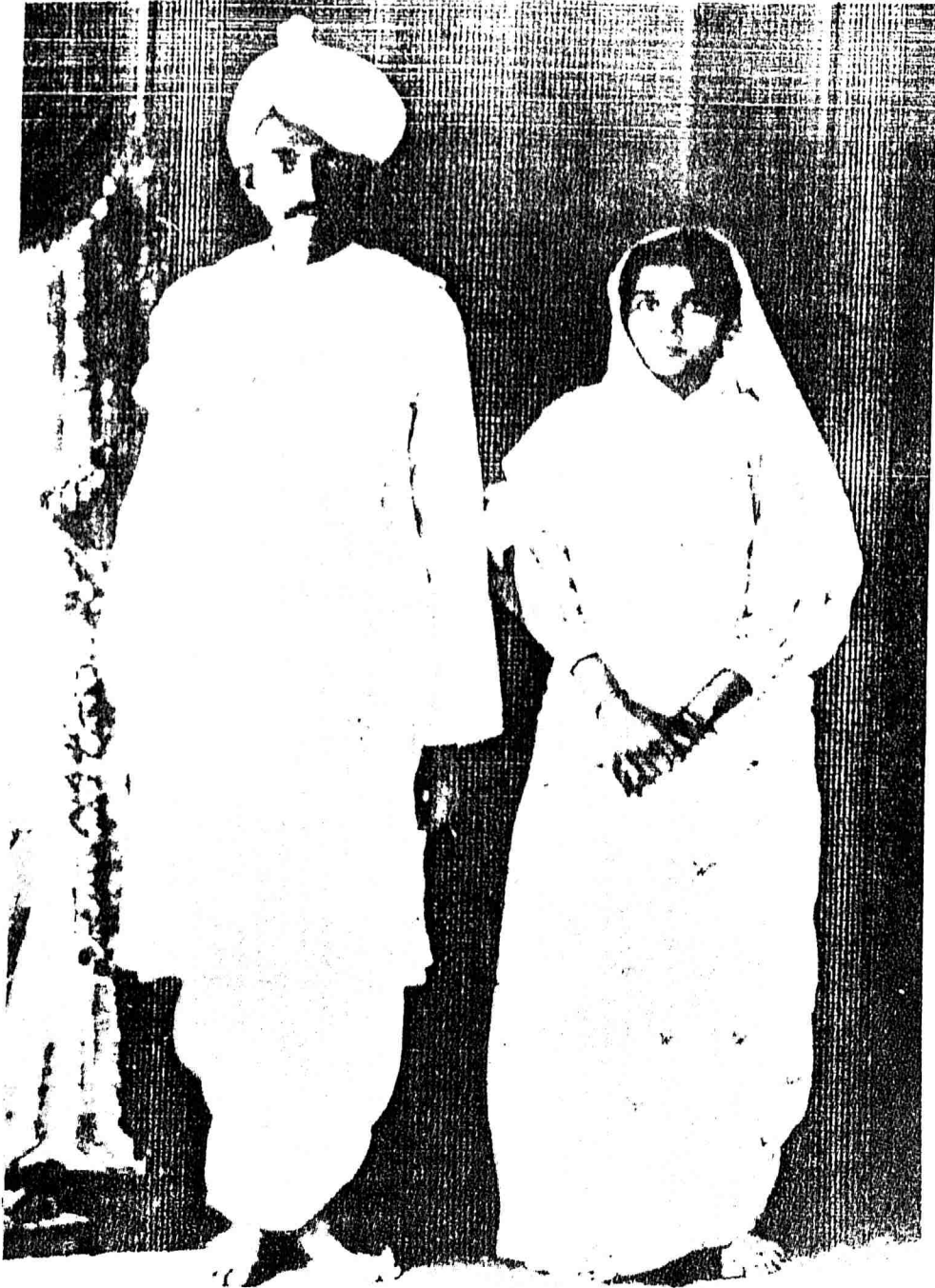
Gandhi and Kasturbai