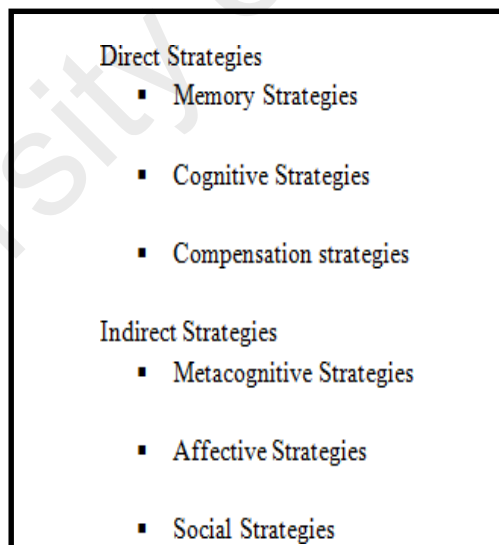
Figure 2. 1 Direct and Indirect strategies (Oxford, 1990, as cited in Aslan 2009)

Rubin comprised communication strategies under the production tricks. The learning strategies and communication strategies are separate manifestations of language learner behaviour. Oxford (1990, p.243) stated that researchers including Rubin, “use communication strategy only in a very limited sense, referring to strategies used only during conversational speech production”. The third group of Rubin’s classification is social strategies. In social strategies, students may have the chances to practice their knowledge by asking questions to their peers or instructors and starting conversation with the second language speakers. In 1990, Oxford took a step further and grouped two main strategies; direct strategies and indirect strategies. These two categories were sub-divided into six other groups. Cognitive, memory and compensation strategies are direct strategies, while affective, metacognitive and social strategies are indirect strategies.